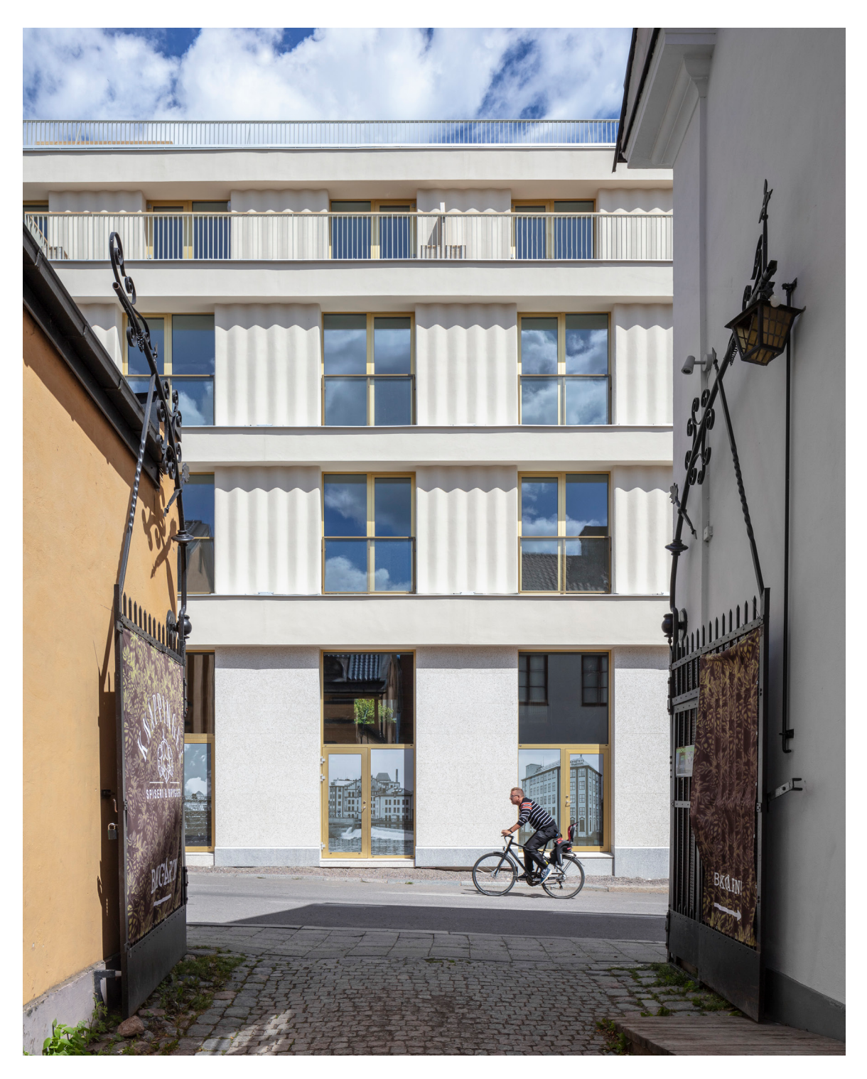
Swedish award winning design reinterprets industrial heritage